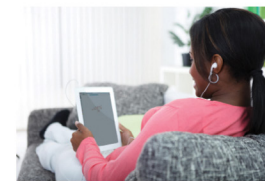
How to Use a Whiteboard