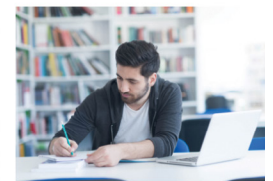
How to Use Writing Feedback

Learn more at smarthinking.com/student-resources